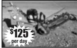
Vermeer Chain Trencher

Check out our rates & other equipment at: WWW.KESTELOOTENTERPRISES.COM