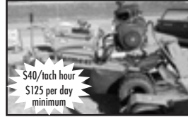
Vermeer Towable Stump Grinder

Check out our rates & other equipment at: WWW.KESTELOOTENTERPRISES.COM