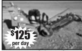
Vermeer Chain Trencher

Check out our rates & other equipment at: WWW.KESTELOOTENTERPRISES.COM